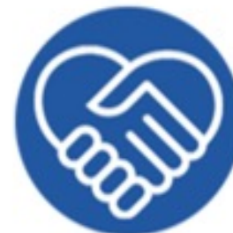
On & Off Campus Referrals